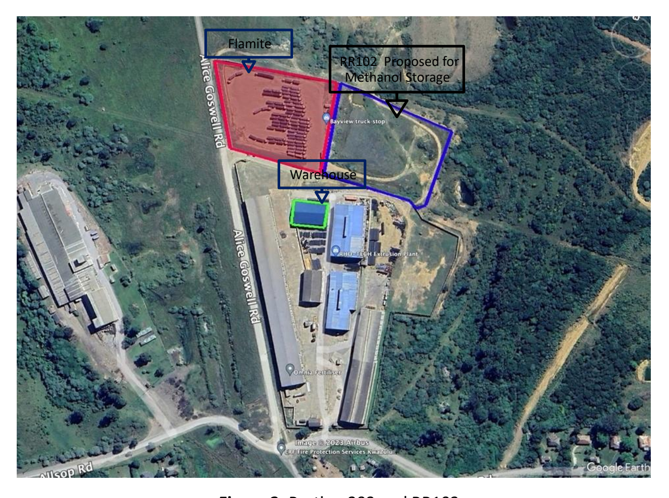
Figure 2: Portion 293 and RR102